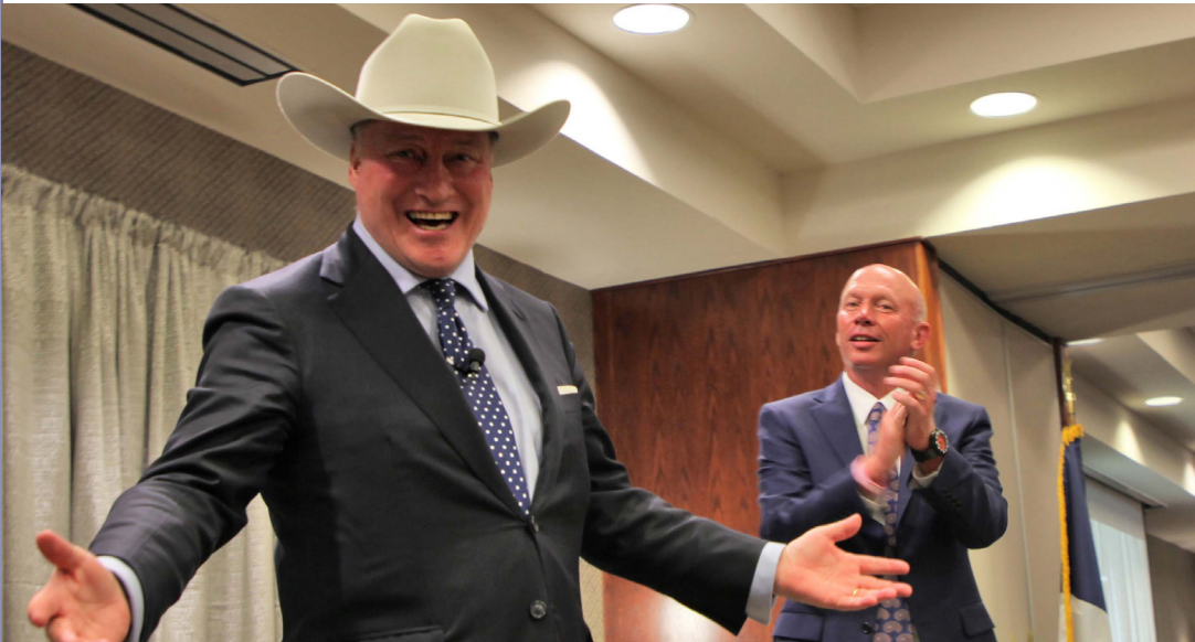
British Historian Dr. Andrew Roberts, left, celebrates his Texas gift at “A Conversation with Winston Churchill Biographer Andrew Roberts” on Feb. 13, 2019.

Dear Friends of McLennan Community College,