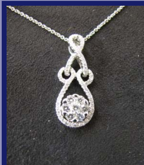
Raffle tickets for this gorgeous white gold and diamond necklace are $30 each or two for $50. Drawing will be held March 27, 2010 at the MCC Foundation Hearts in the Arts Gala.

Also featured at the Gala this year is a jewelry raffle with chances to win a gorgeous white gold and diamond necklace from Kindler’s Gem Jewelers, valued at $2,800. All proceeds from the Gala and jewelry raffle benefit student scholarships at MCC. We are accepting sponsorships for this fantastic event through January 15, 2010. Call the MCC Foundation at 299-8604 for more information.