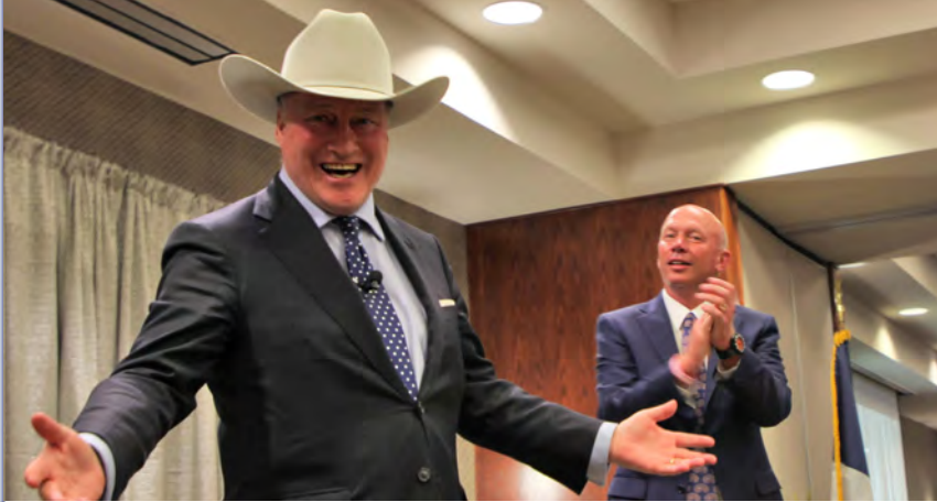
British Historian Dr. Andrew Roberts, left, celebrates his Texas gift at “A Conversation with Winston Churchill Biographer Andrew Roberts” on Feb. 13, 2019.

Dear Friends of McLennan Community College,