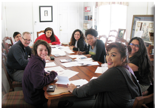
MCC Foundation Scholarship Recipients