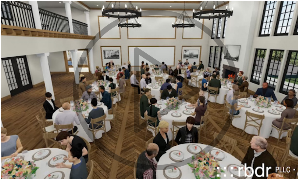
Above: A rendering of the design for an event space/ballroom in the forthcoming building. Click the photo to see a virtual video of the full design.