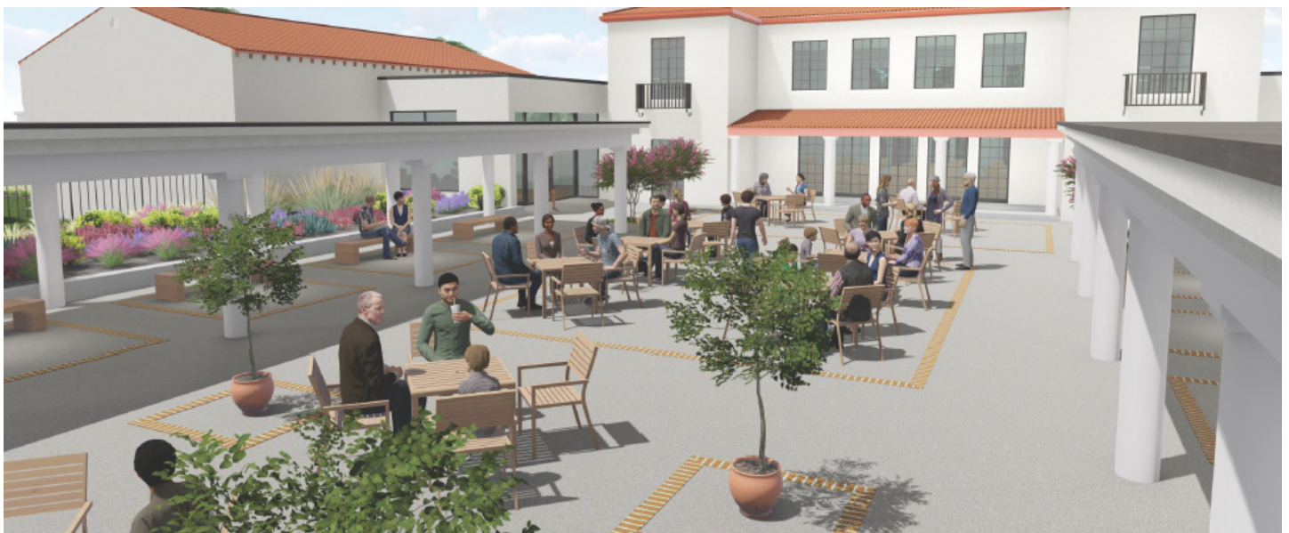
The Cameron Courtyard will once again host business and social events.