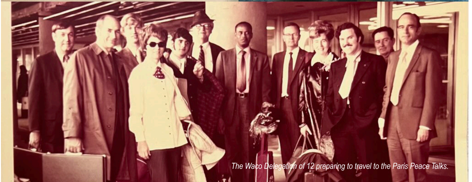
The Waco Delegation of 12 preparing to travel to the Paris Peace Talks.