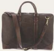
TECOVAS Doc Goat Broad Square Toe Boots