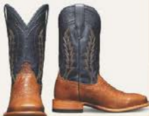
TECOVAS Daisy Women's Booties