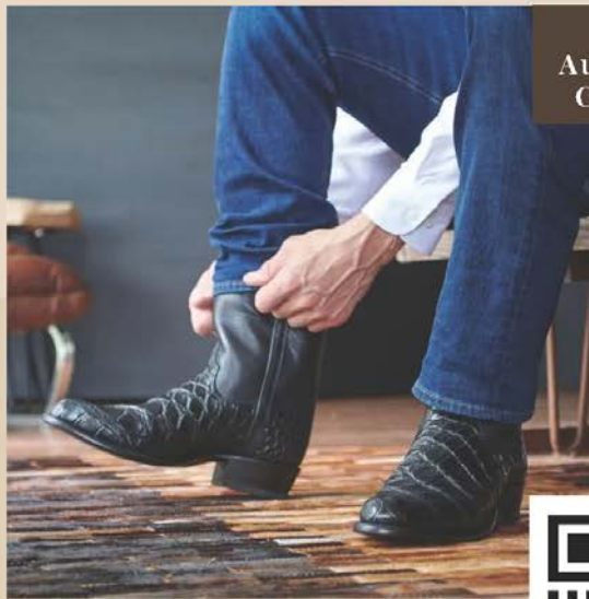
TECOVAS Austin Alligator Cowboy Boots

Drawing will be held at the 37th Annual MCC Foundation Golf Classic on Friday, October 6, 2023. Thank you for supporting scholarships at McLennan Community College!