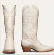
LUCHESE Cowhide Briefcase