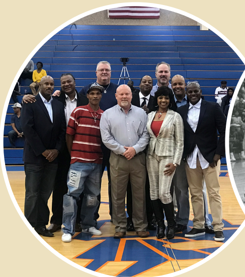
Class of 1985 recognized at halftime.

There are some great pictures below and in the album "Class of 1985 Reunion" on the MCC Highlander Alumni Association's Facebook page. Click here to check them out, and while you are there, be sure to "Like" our page so that we can stay in touch. If you would like to join the Highlander Alumni & Friends Association, contact alumni@mclennan.edu or (254) 299-8481. Membership is free and open to all alumni and friends of McLennan Community College.