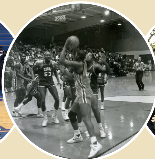
MCC Class of 85' Basketball Game