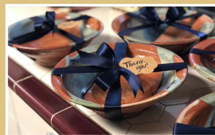
Custom pottery bowls commemorating the time and service of outgoing MCC Foundation Board Members.