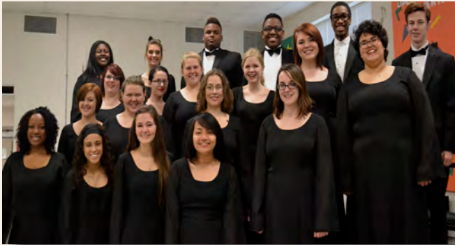
The McLennan Community College Chorale prior to performing at an area high school.