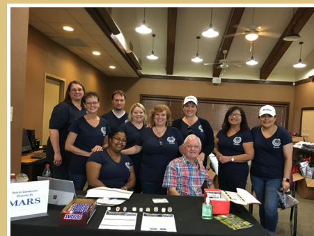
Golf tournament volunteers made the event run smoothly.