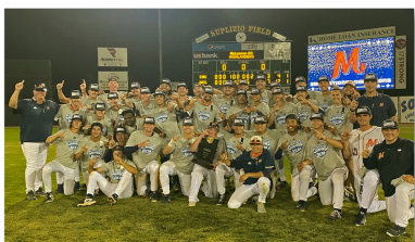
2021 National Champion McLennan Highlanders

Yes! Please count me in your exciting Home Field Advantage campaign to help the McLennan baseball and softball programs reach a new level of excellence! This initiative will improve the fields, add artificial turf, and install lights for night games that will enable year-round college and tournament use.