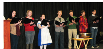
McLennan music students