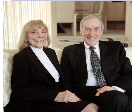
Audre and Bernard Rapoport funded the First Generation College Student Initiative with its initial $100,000 grant and later endowed the program with a $1 million gift.

Candace can be reached at cbolden@esc12.net and Ashley can be reached at ashley.bolden@midwayisd.org .