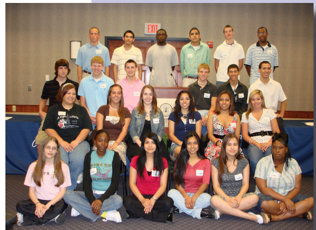
With 24 members, the 2007 class of the First Gen program was one of the largest cohorts in program history. First Gen students say being in a cohort contributes to their success.