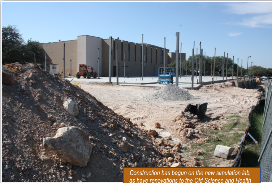
Construction has begun on the new simulation lab, as have renovations to the Old Science and Health Careers buildings.

cated and technically proficient professionals will be serving our local citizenry.