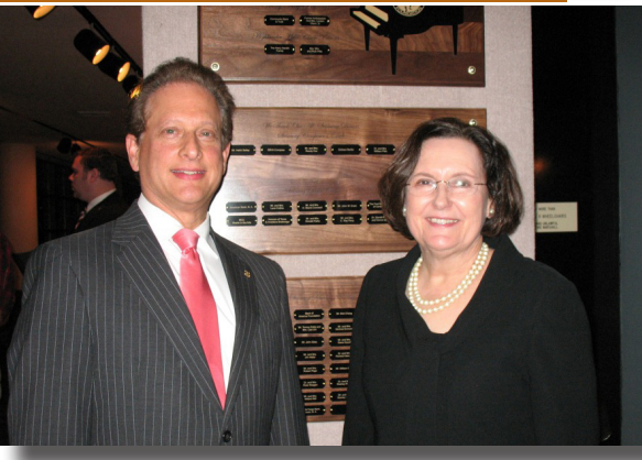
While the All-Steinway Campaign draws to a close, we still welcome additional gifts to support the ongoing maintenance of these quality instruments. If you would like to contribute, please contact the MCC Foundation at 299-8606.