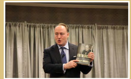
Sir Winston Churchill biographer, Dr. Andrew Roberts, at the MCC Conference Center.

With your support, the gala raised more than $31,000 for student scholarships and other student needs at MCC!