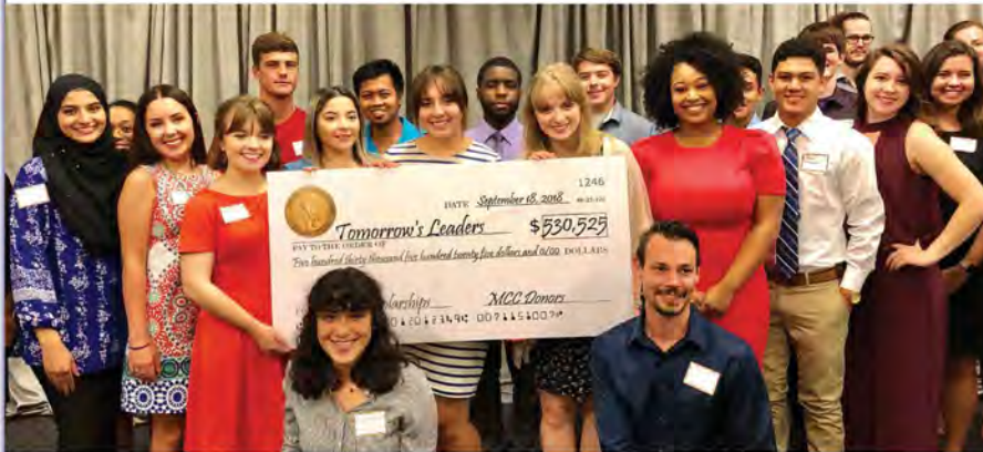
Scholarship recipients celebrate a new milestone in scholarship awards at the Scholar, Donor, and Alumni Appreciation Luncheon on Sept. 18, 2018.

Dear Friends of McLennan Community College,