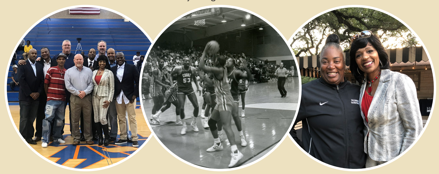
Class of 1985 recognized at halftime.

There are some great pictures below and in the album "Class of 1985 Reunion" on the MCC Highlander Alumni Association's Facebook page. Click here to check them out, and while you are there, be sure to "Like" our page so that we can stay in touch. If you would like to join the Highlander Alumni & Friends Association, contact alumni@mclennan.edu or (254) 299-8481. Membership is free and open to all alumni and friends of McLennan Community College.