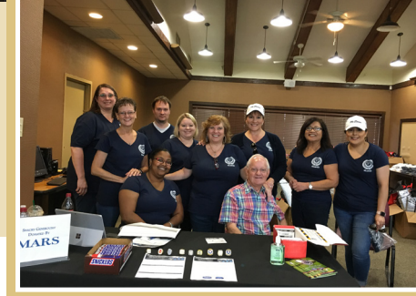
Golf tournament volunteers made the event run smoothly.

Plans are underway for the Foundation's 33rd Annual Golf Classic on Friday, October 4, 2019. We'll see you there!