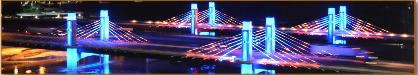
The City of Waco lit up the I-35 bridges in orange and blue on May 5 in honor of MCC's 50th Anniversary Gala.